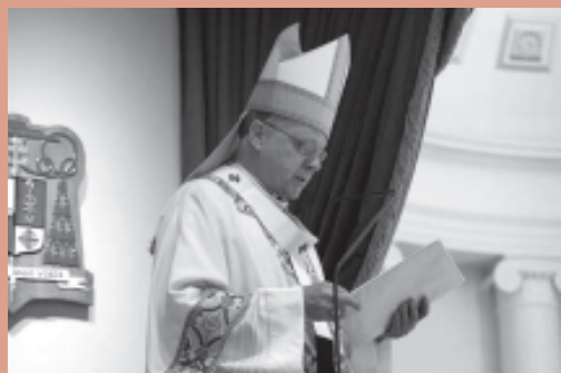
Most Rev. Edwin O'Brien, Archbishop of Baltimore

"The Bishop and all those who take part in the Inquiry must see to it with the greatest diligence and commitment that, in gathering all the proofs, nothing is omitted which in any way regards the cause. The positive outcome of the cause, in fact, depends to a great extent, on its good instruction...." -- Sanctorum Mater , Art. 47, Congregation for the Causes of Saints, Rome 2007