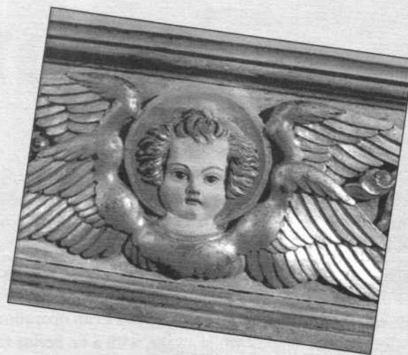
Detail, high altar, St. Mary's Assumption Church, New Orleans; mid-nineteenth-century bas-relief, wooden polychrome.